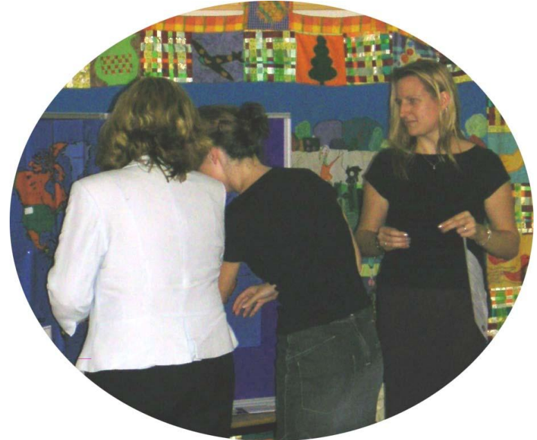
Teachers as pupils with FEEDU – Climate change Map Activity